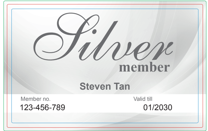
Page 2: Sample Artwork

Put the longest VDP number & text in the space and within safe zone to make sure the artwork outcome can printed out.